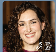
Jillee Various Genres