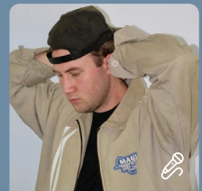
Edwin Boulevard Country, Acoustic Pop