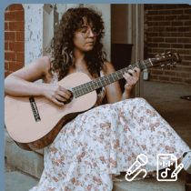
Chloe Gilpin Acoustic Pop